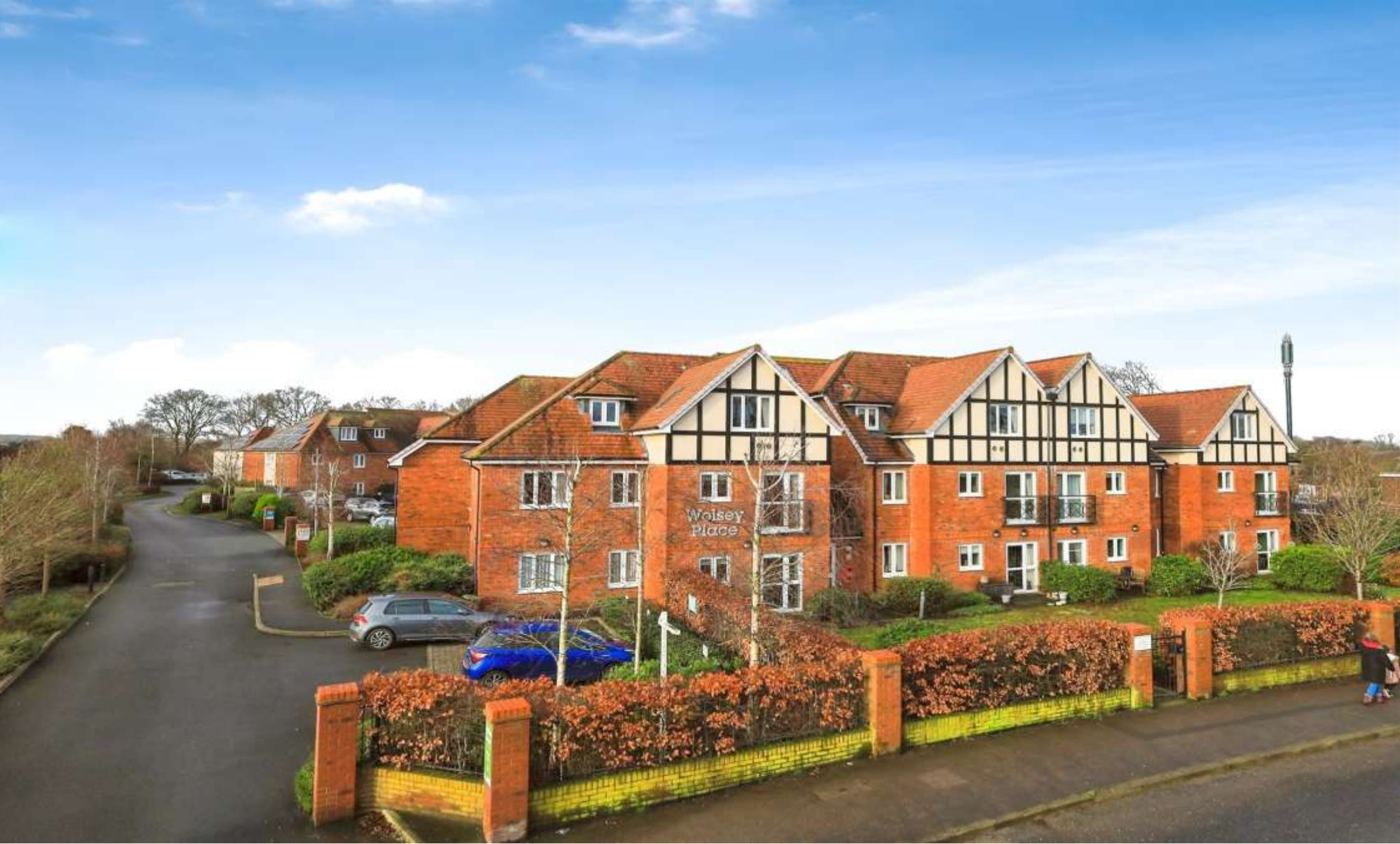
Wolsey Place, London Road, Hailsham BN27 3FU