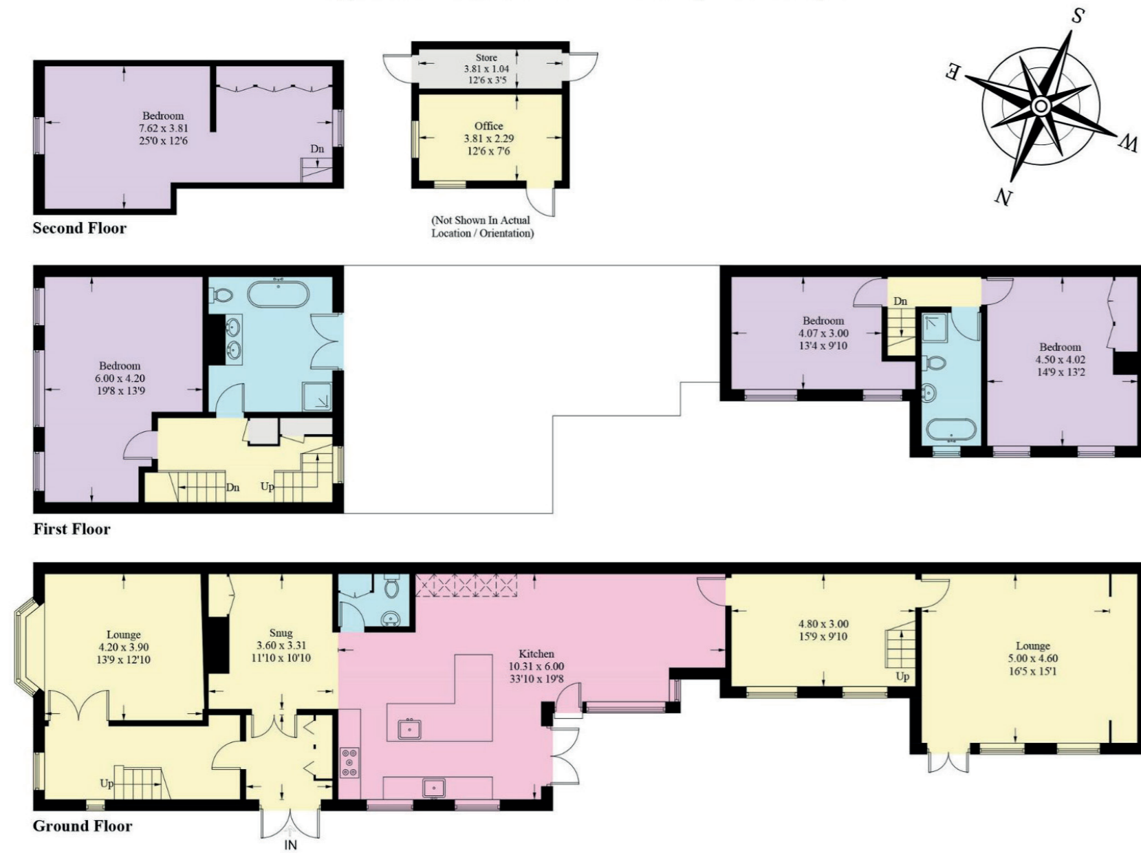
Illustration for identification purposes only, measurements are approximate, not to scale. Fourlabs.co © (ID1258597)

Approximate Gross Internal Area = 259.3 sq m / 2790.6 sq ft