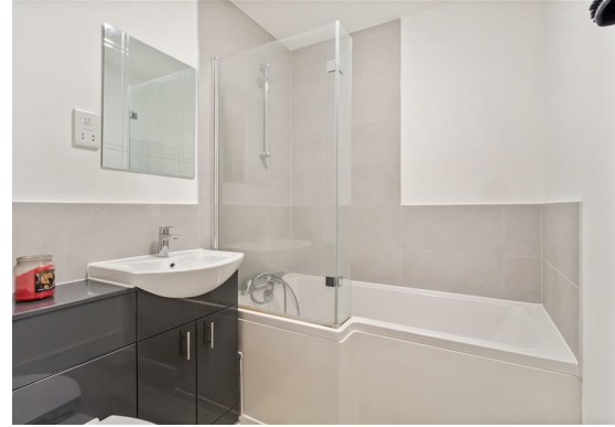
Shaker Style Kitchen Area Modern Fitted Bathroom