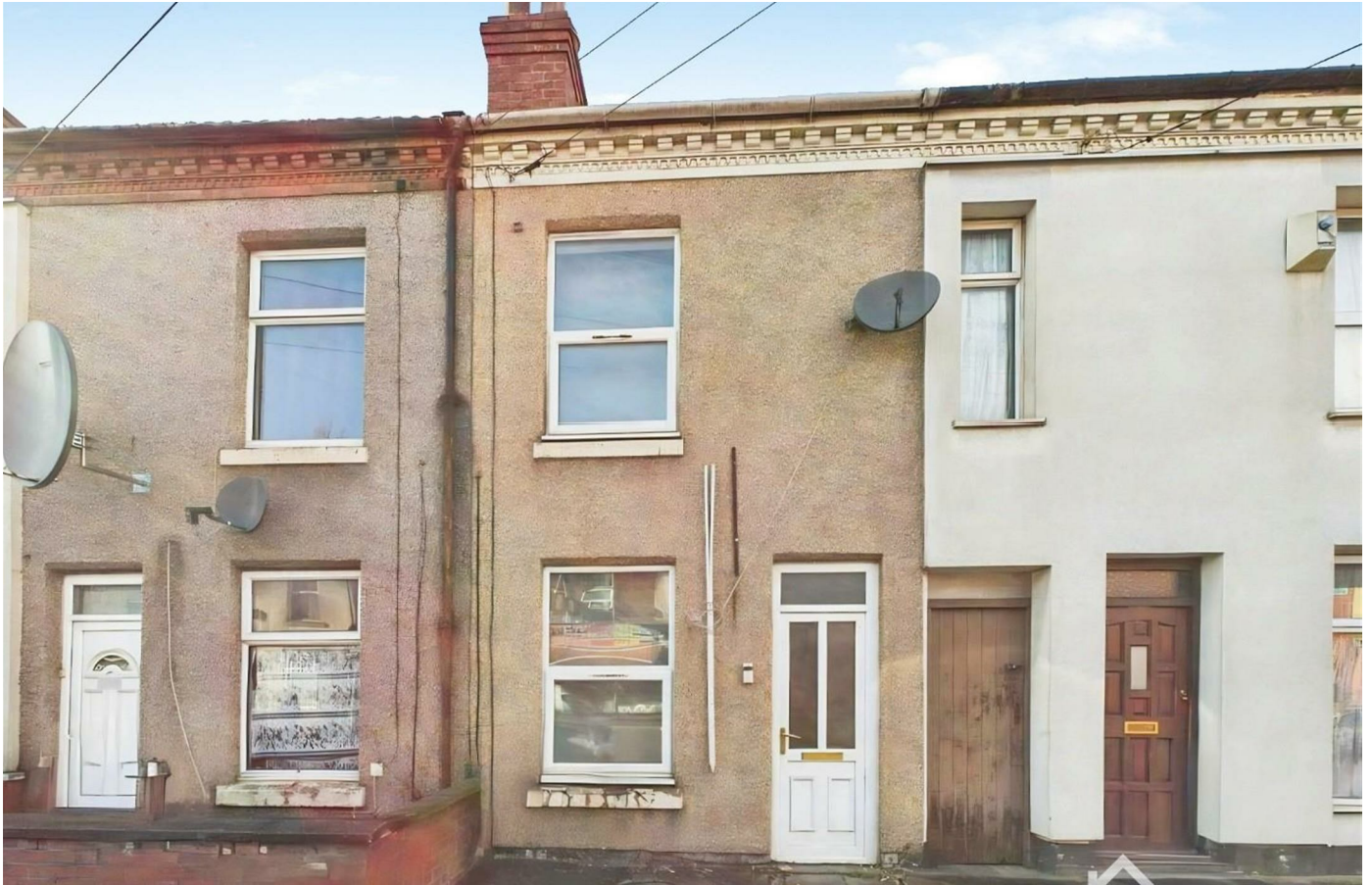
Stoney Stanton Road, Coventry