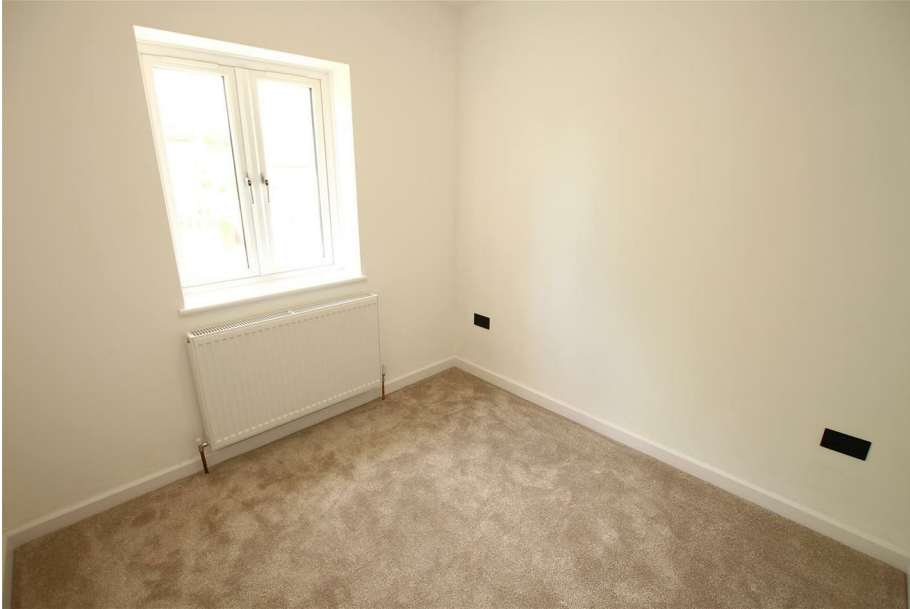
Bedroom Three 8'6" x 8'3" (2.598 x 2.529 ) Window to front.