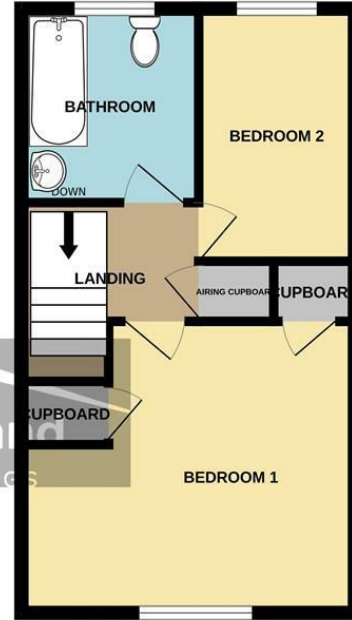
1ST FLOOR 291 sq.ft. (27.0 sq.m.) approx.