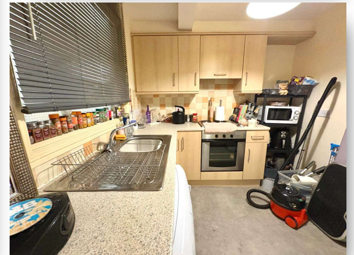
The Maltings, Dereham, NR19 2UU