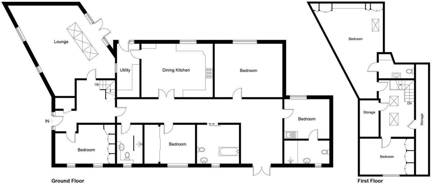
Illustration for identification purposes only, measurements are approximate, not to scale. Fourlabs.co © (ID1291036)

Approximate Gross Internal Area = 304.2 sq m / 3274 sq ft