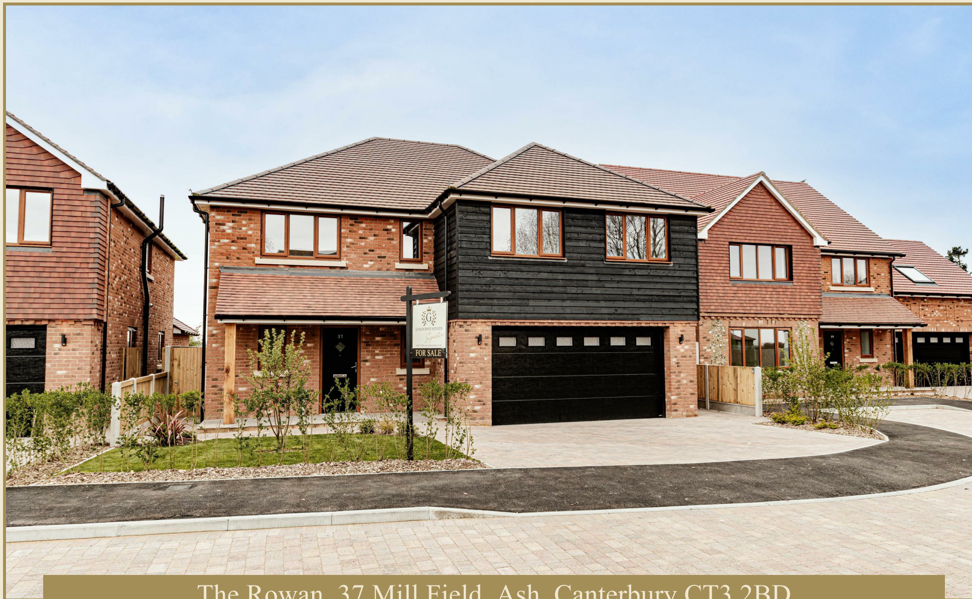
The Rowan, 37 Mill Field, Ash, Canterbury CT3 2BD