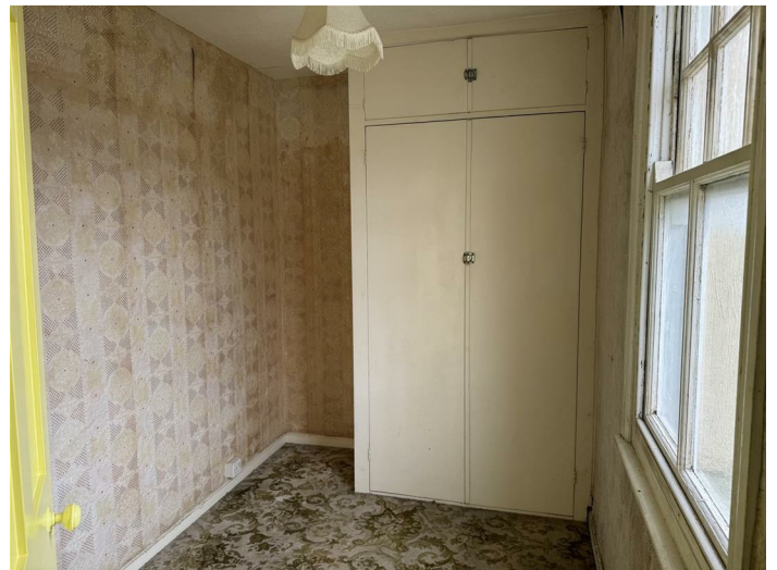
Window to rear elevation. In-built cupboard.