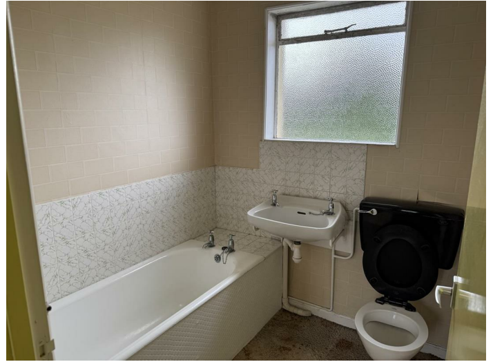
Panel enclosed bath. Low level WC. Hand wash basin. Window to rear elevation.