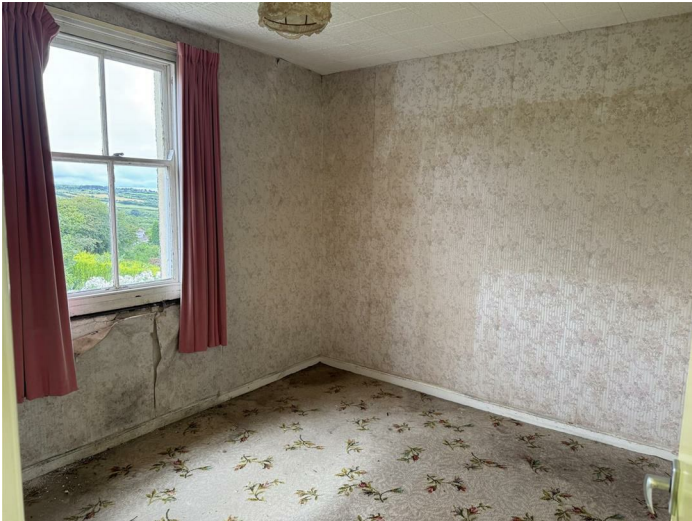
Window to rear elevation.