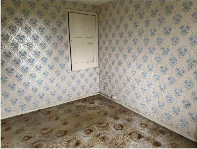
Window to front elevation. In-built double cupboard.