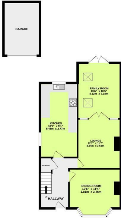
GROUND FLOOR 799 sq.ft. (70.5 sq.m.) approx.