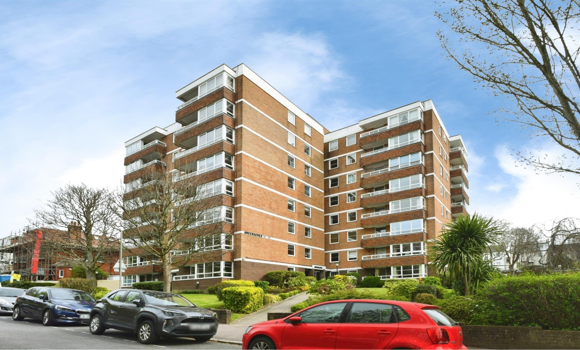
Greenacres, Preston Park Avenue, Brighton, BN1 6HR