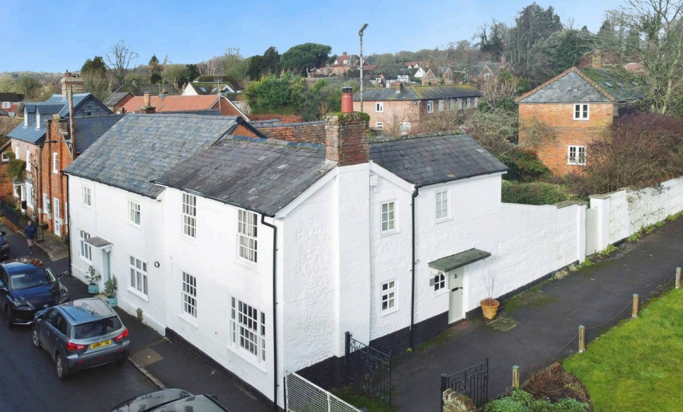
Cinnabar Cottage, 28 High Street, Ramsbury £495,000