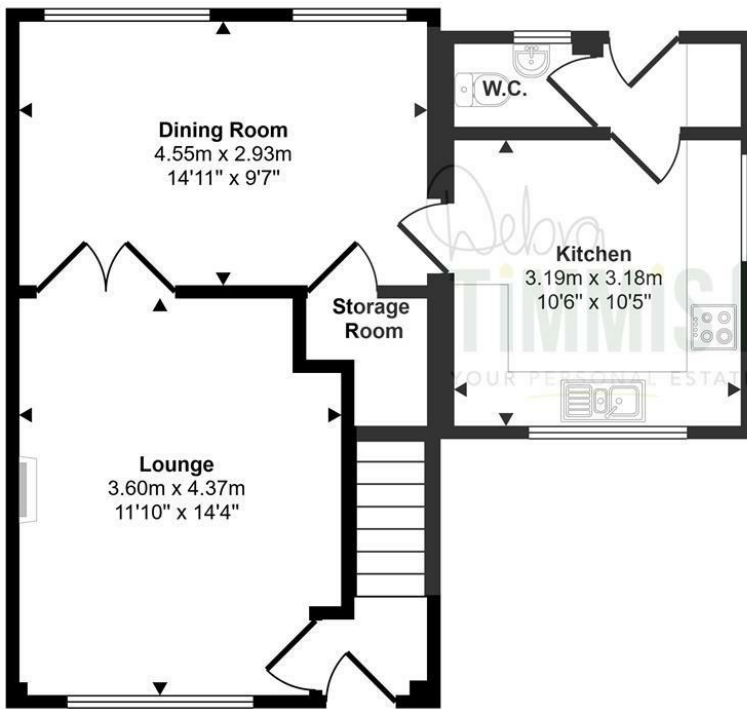
Ground Floor Approx 49 sq m / 523 sq ft

Approx Gross Internal Area 83 sq m / 894 sq ft