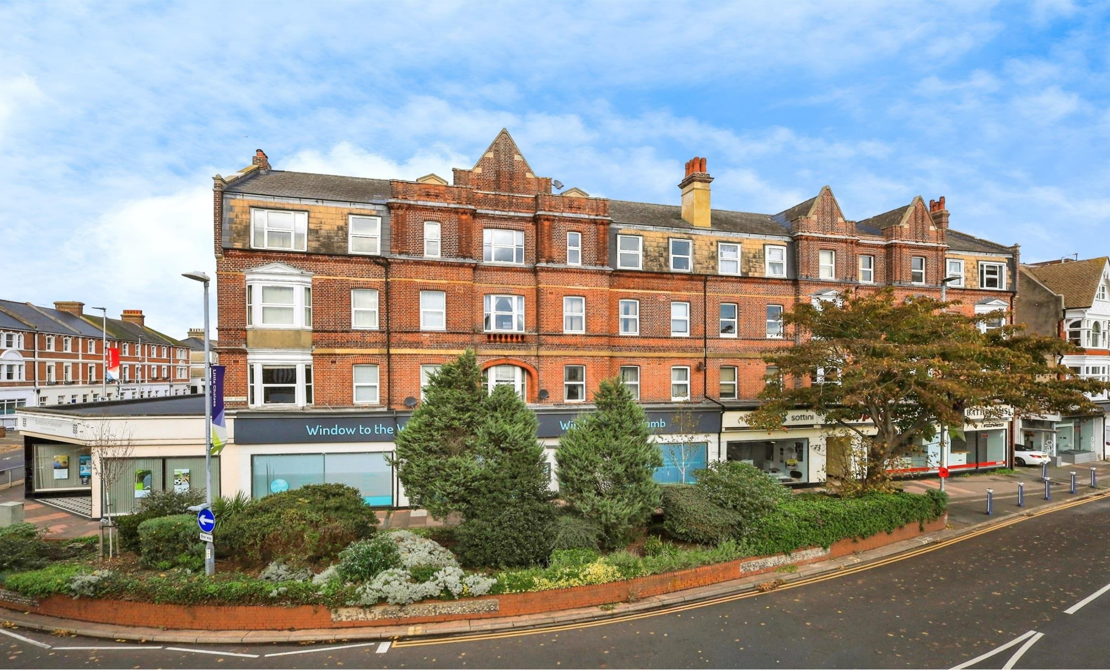
Greystone Court South Street, Eastbourne BN21 4LP