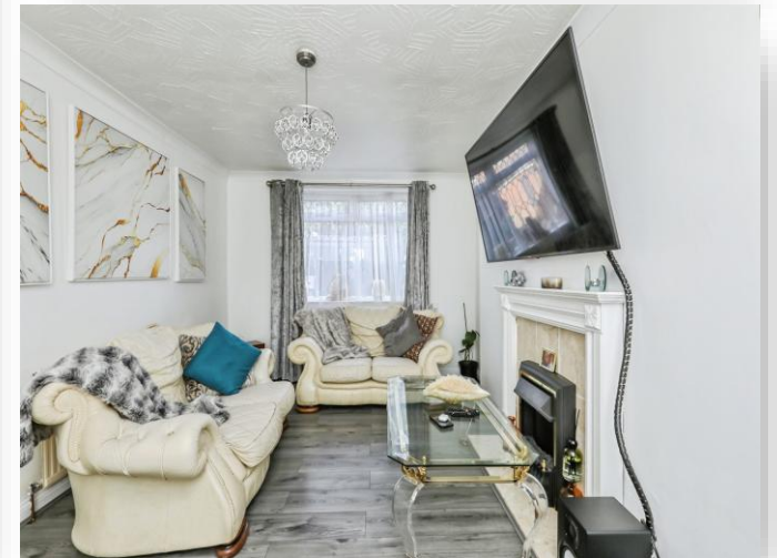
Brunswick Street, Thurnscoe Rotherham S63 0HY