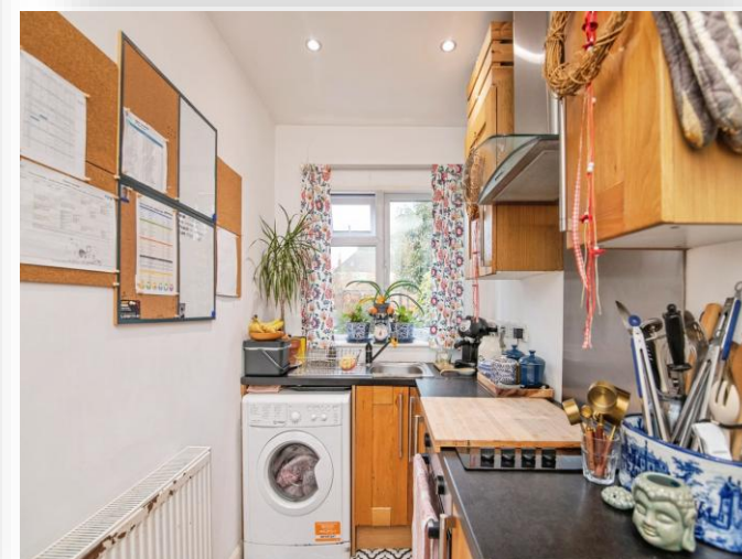
Worlds End Lane, Quinton Birmingham B32 1JX