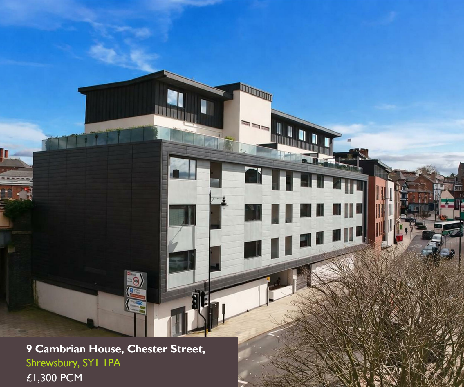
9 Cambrian House, Chester Street, Shrewsbury, SY1 1PA £1,300 PCM