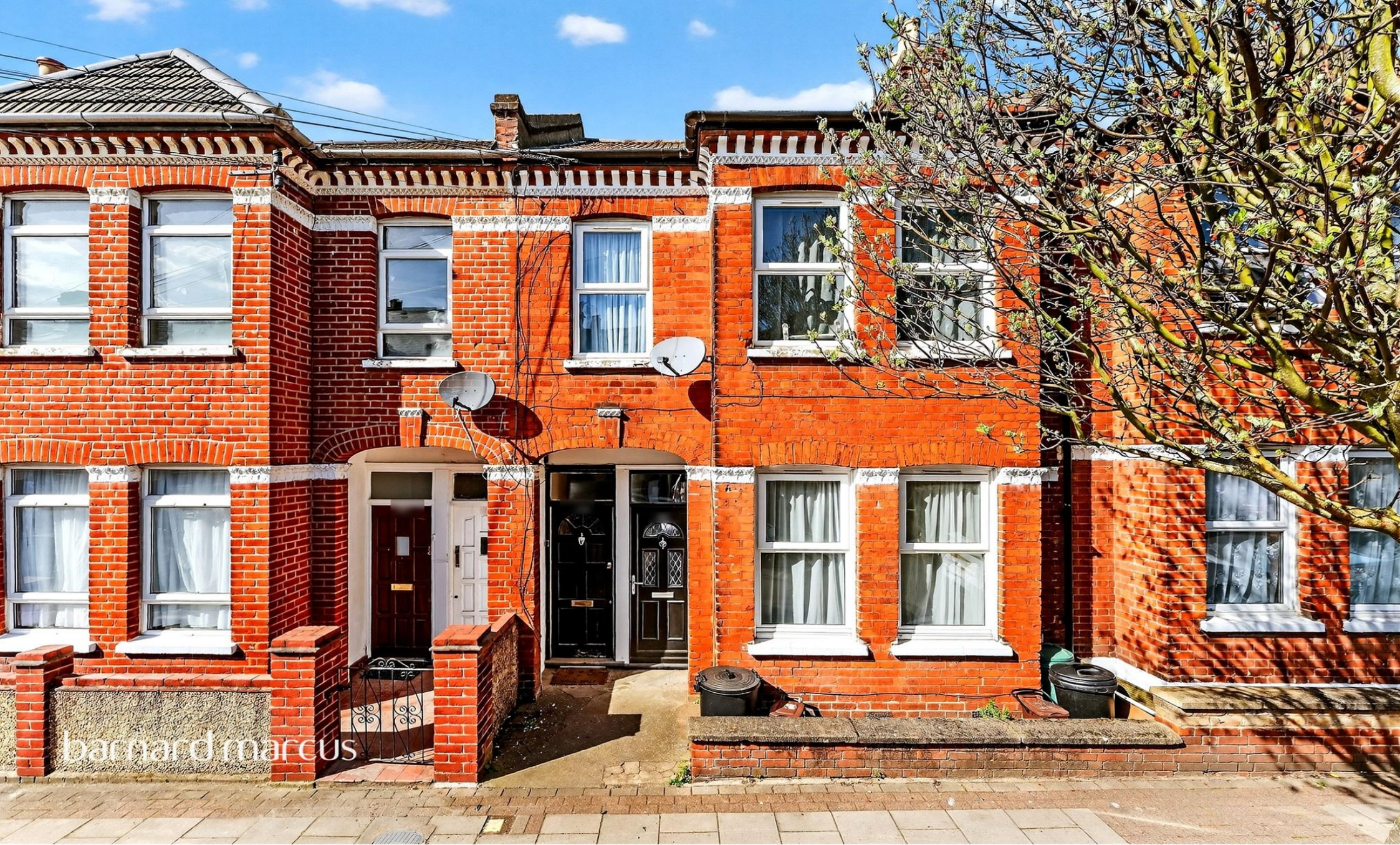
Leveson Street, London SW16 6DF