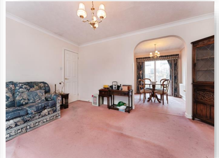
Heyford Court, Mildenhall IP28 7DQ