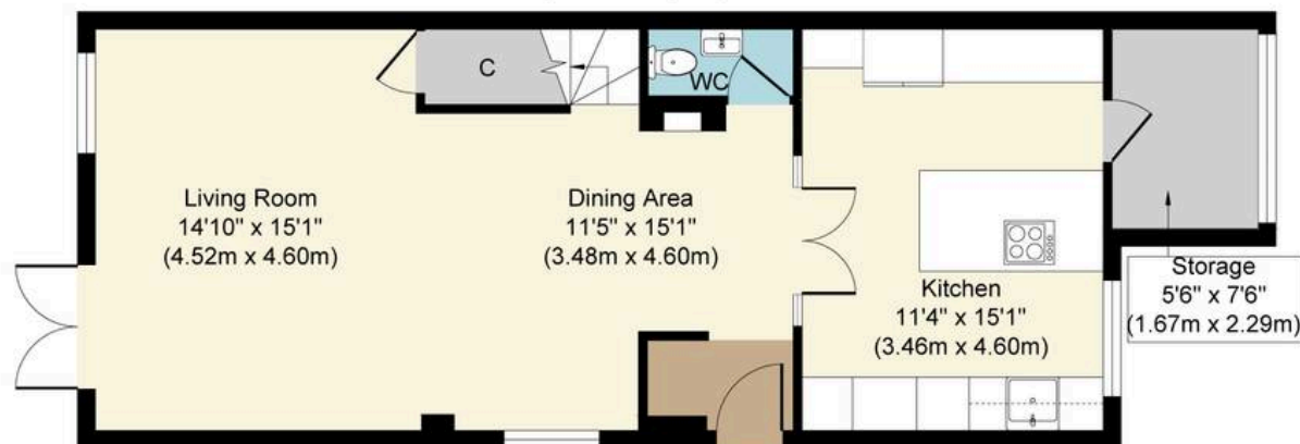
Ground Floor Approximate Floor Area 616 sq. ft (57.22 sq. m)

South Albert Road, RH2 Approx. Gross Internal Floor Area 1168 sq. ft / 108.50 sq. m