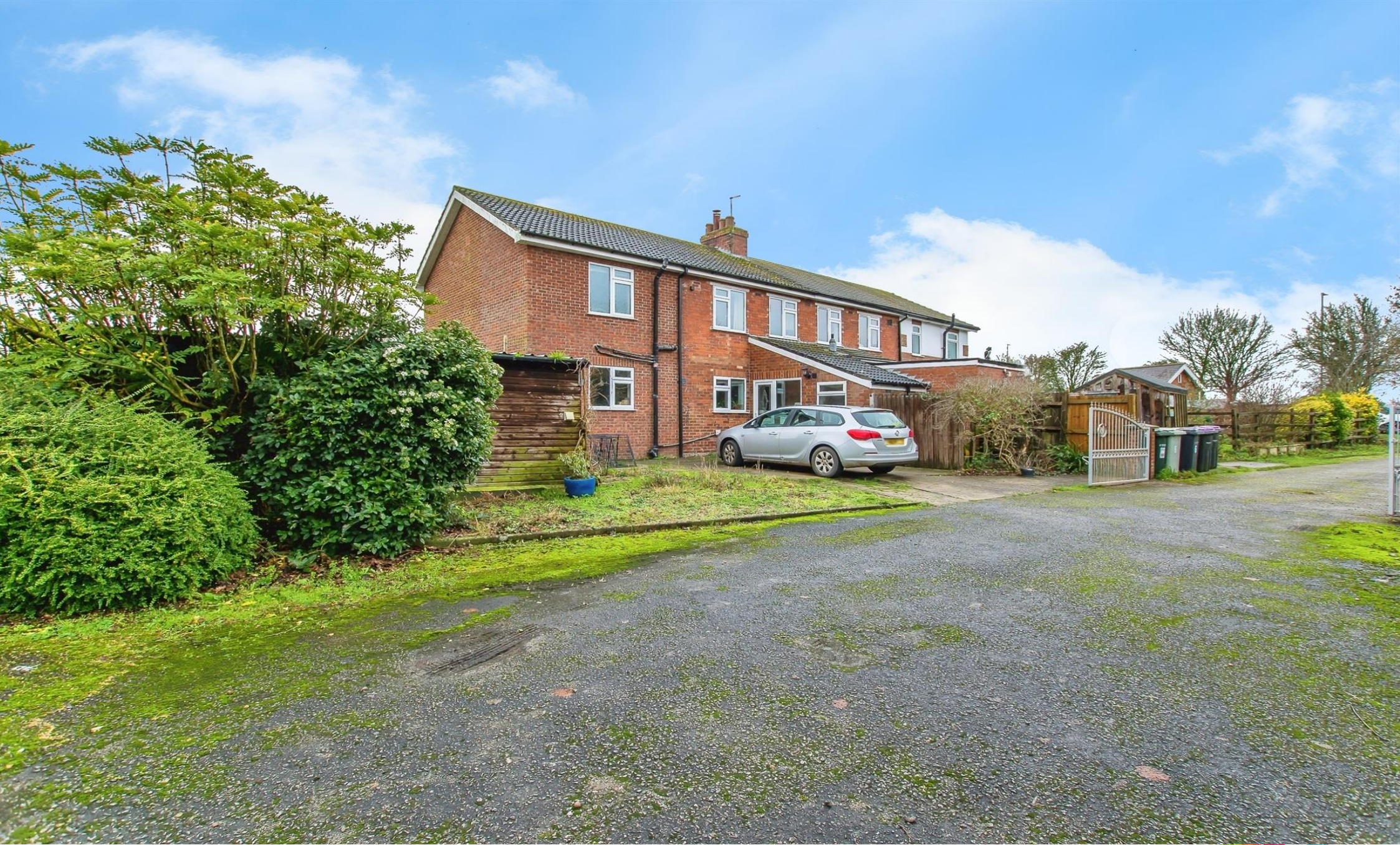
Station Cottage Main Road, Stickney Boston PE22 8EE