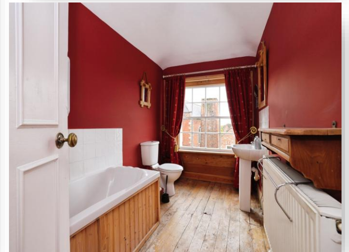
Flat 3, Northgate Street, Devizes SN10 1JT