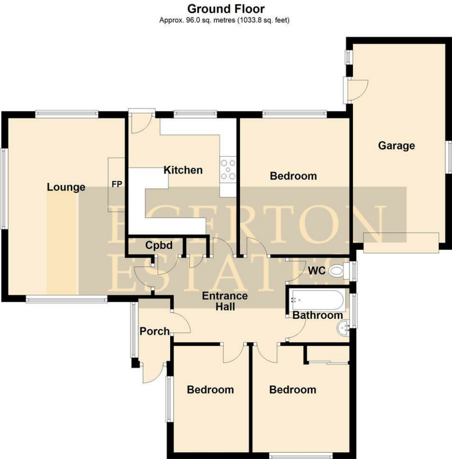
Total area: approx. 96.0 sq. metres (1033.8 sq. feet) This floor plan is for illustrative purposes only and may not be representative of the property. The measurements are approximate and are for illustrative purposes only. Plan produced using PlanUp.