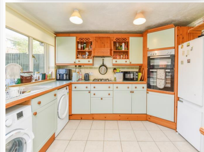
Holly Court, Frome BA11 2SQ