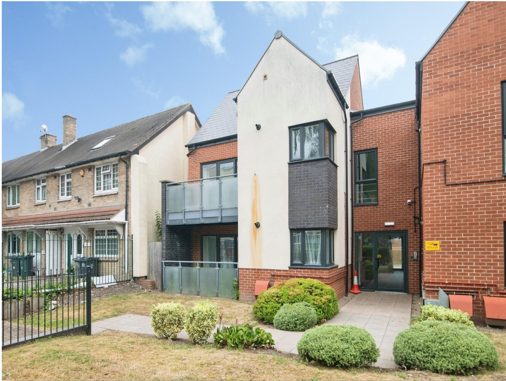
Burton Wood Drive, Birmingham B20 3UZ