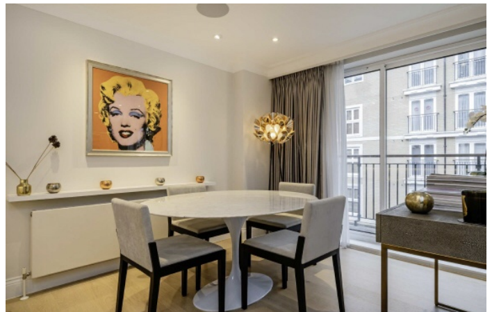
Victoria Street, SW1H