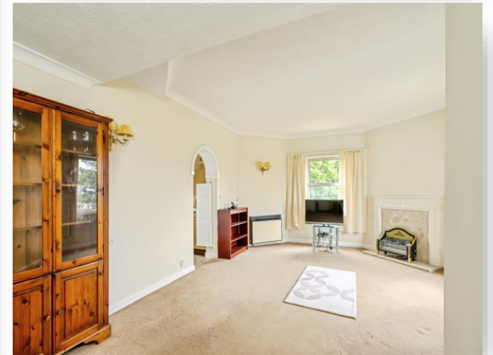
Claremont Court Campbell Road, Bognor Regis PO21 1HD