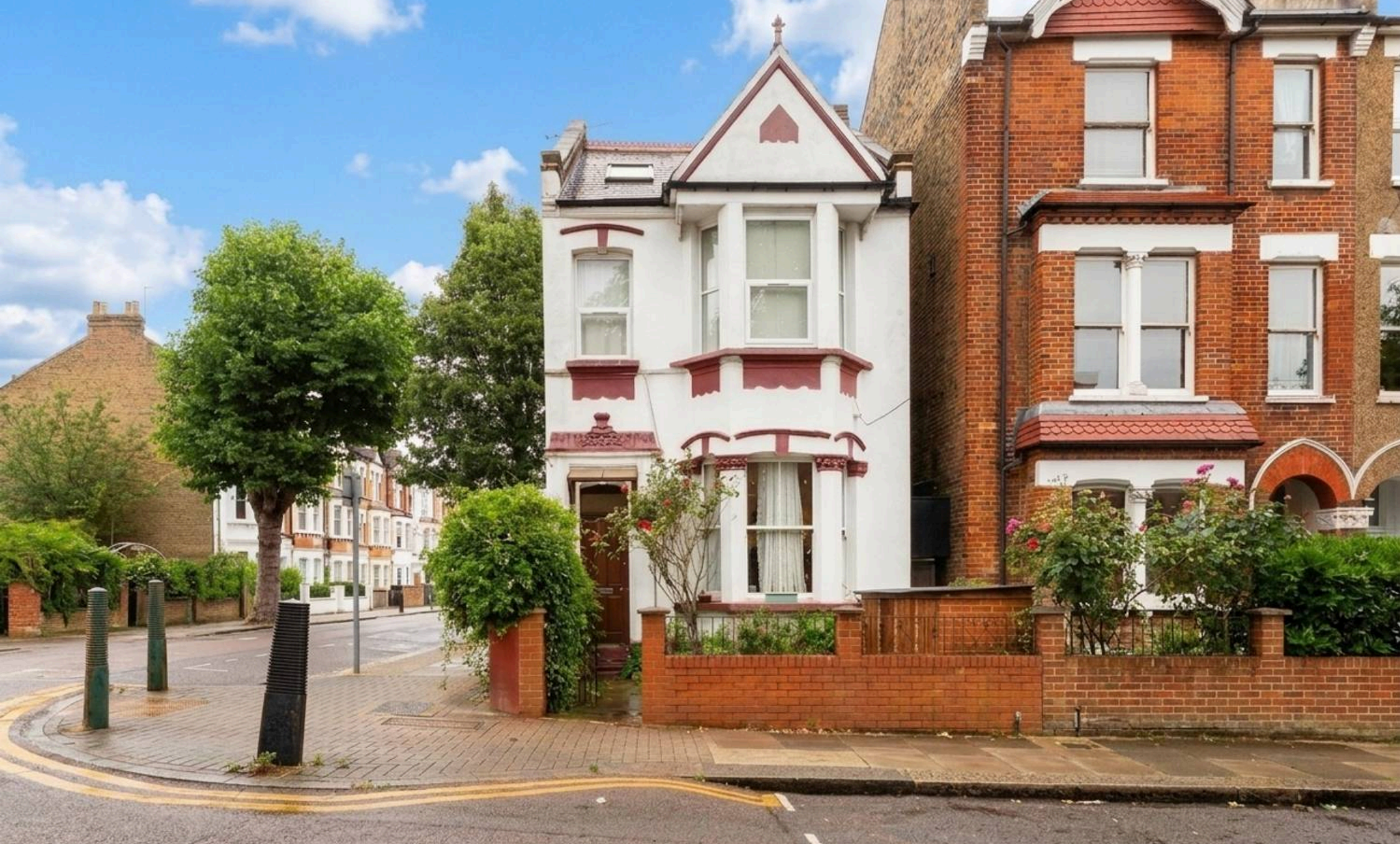
Streatley Road, Kilburn, NW6 £1,800 pcm