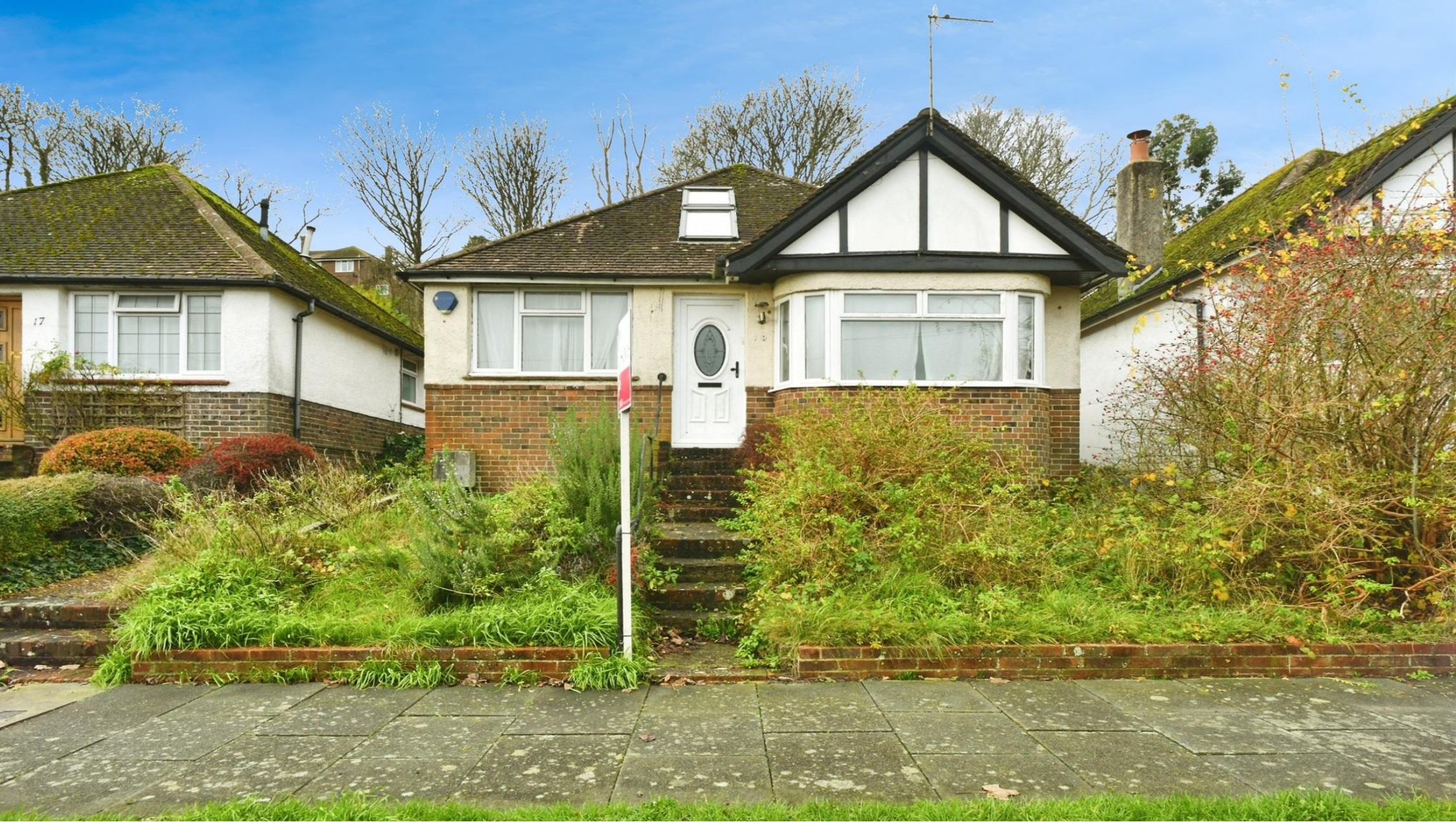
Eley Crescent, Rottingdean Brighton BN2 7FE