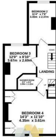
1ST FLOOR 415 sq.ft. (38.6 sq.m.) approx.