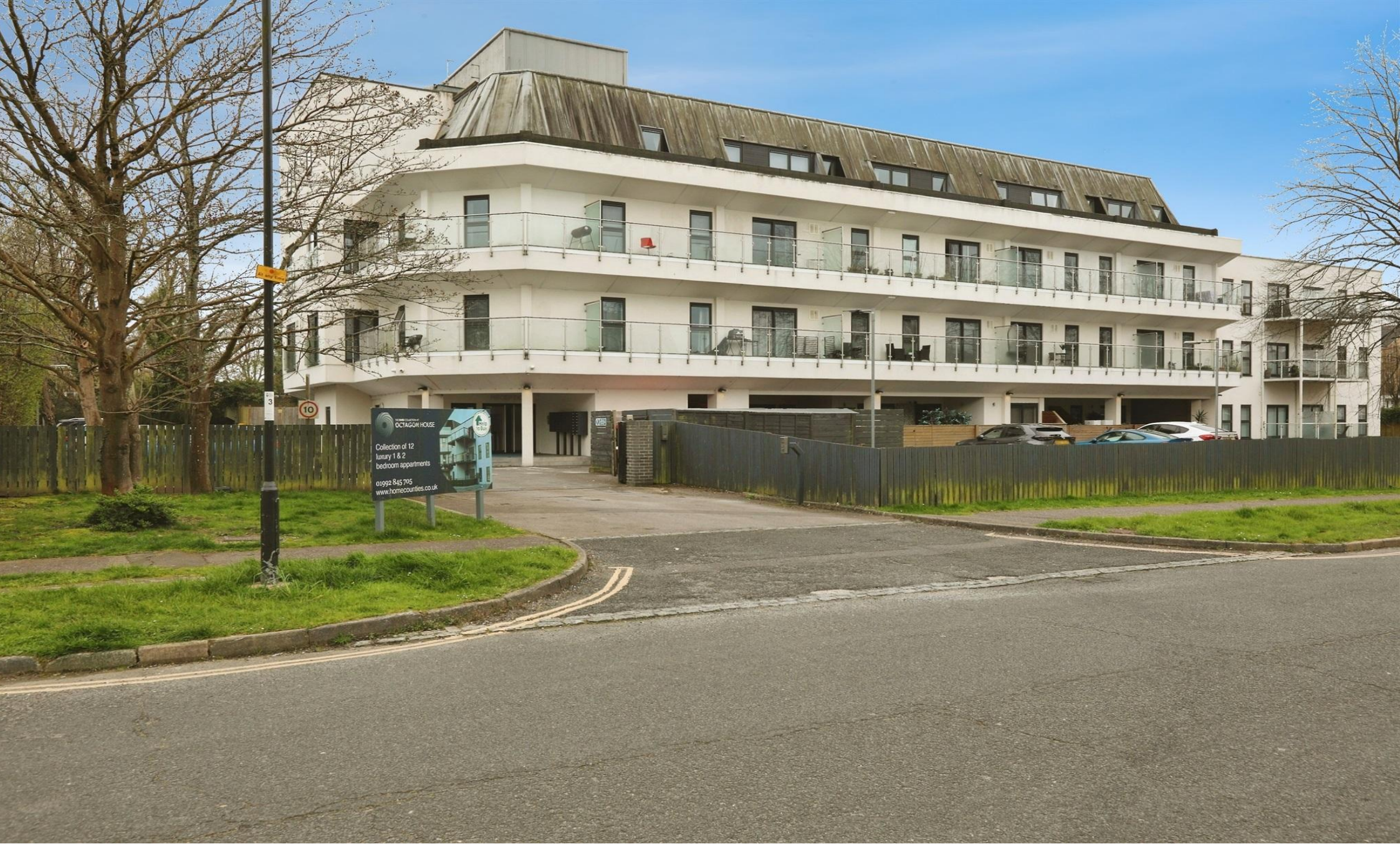
Octagon House Russell Way, Crawley RH10 1GW