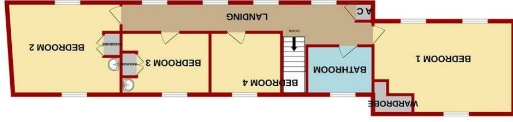
1ST FLOOR 851 sq.ft. (79.1 sq.m.) approx.