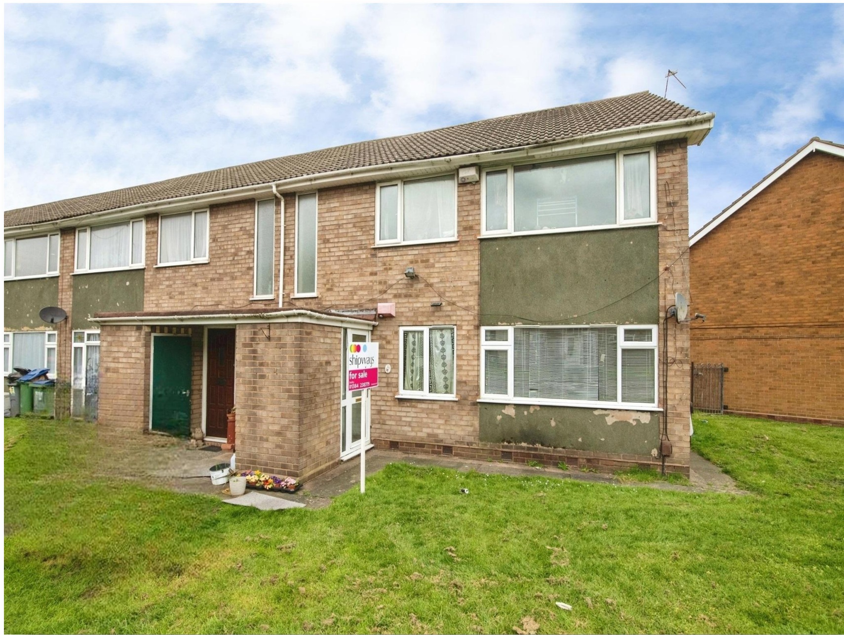
Tudor Court, Tipton DY4 8UX