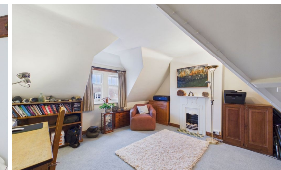
HENLLYS, ROBIN HOODS BAY- 5 bed Semi-Detached House -£475,000