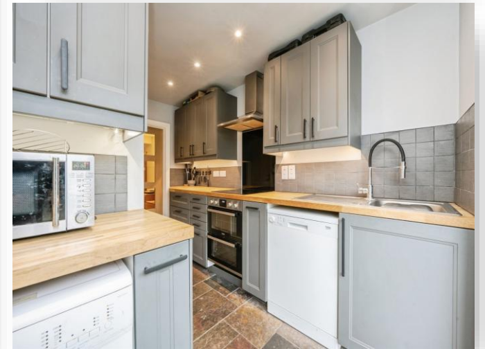
Hockliffe Street, Leighton Buzzard, LU7 1EZ