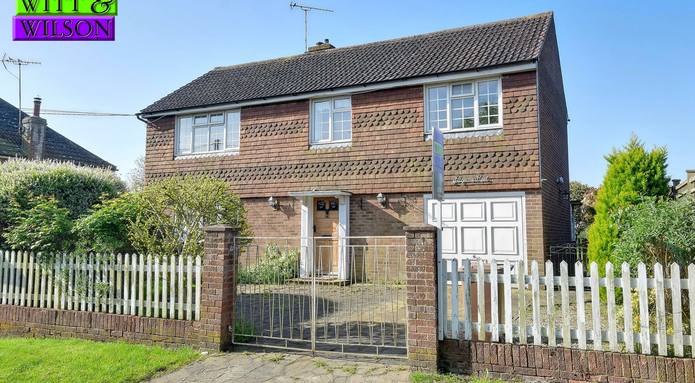
Pilgrims Rest Maytham Road, Rolvenden Layne, Kent TN17 4NS Guide Price £390,000