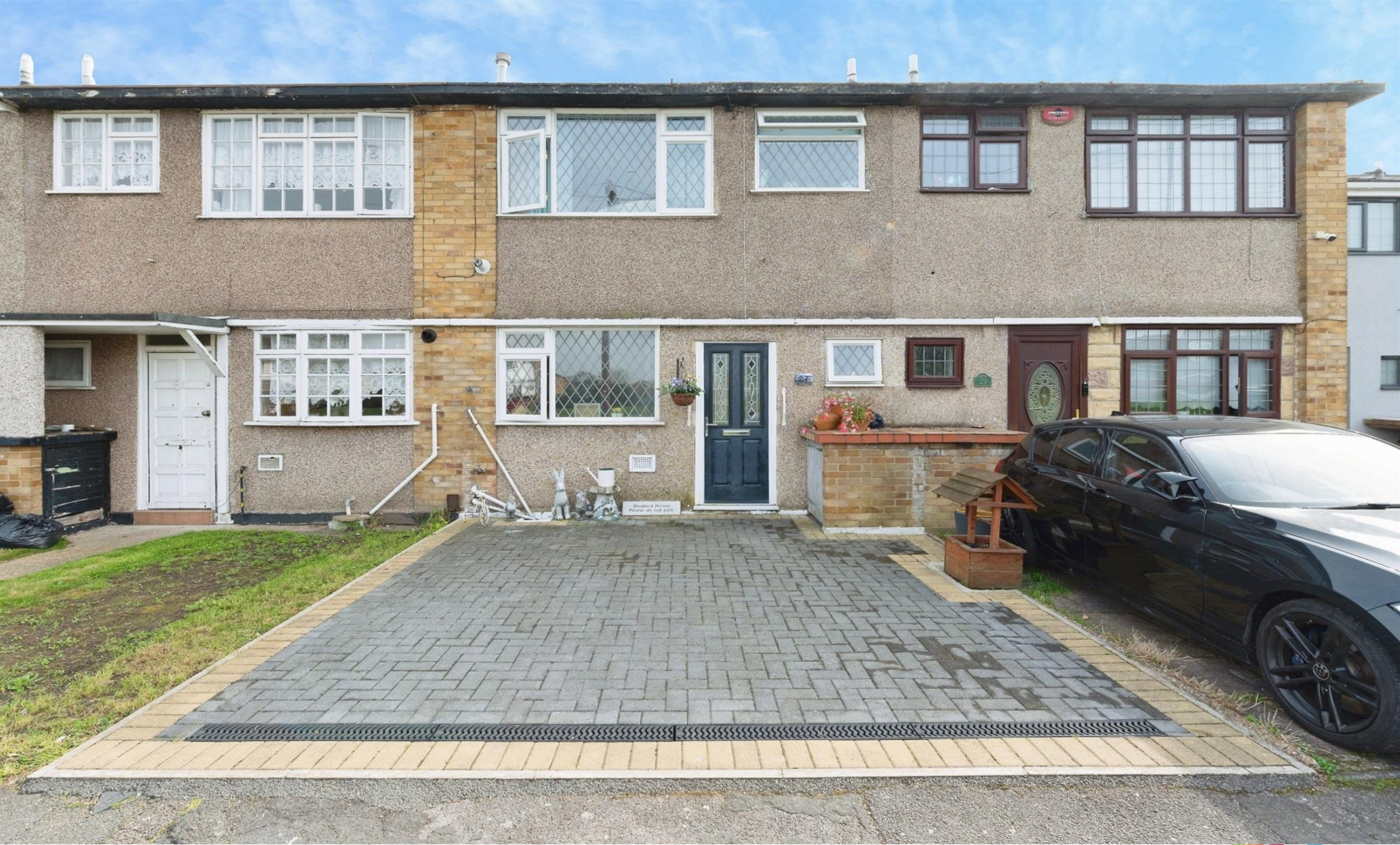
Blake Close, Rainham, RM13 8BE