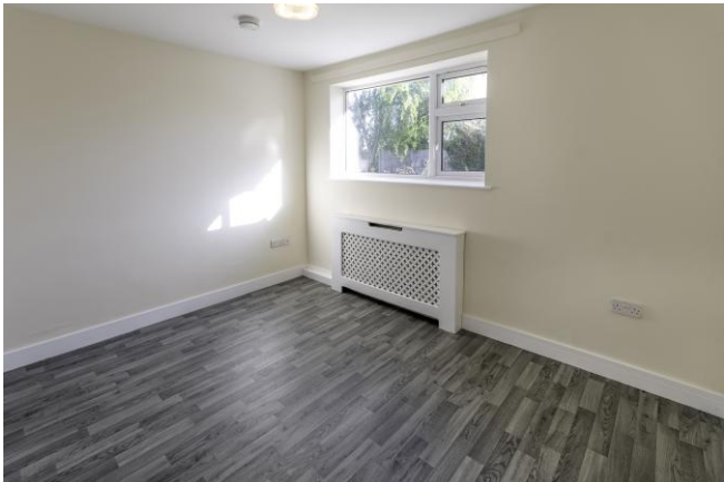
BEDROOM THREE 10'9" x 9'4" (3.32m x 2.85m) side aspect double glazed window.