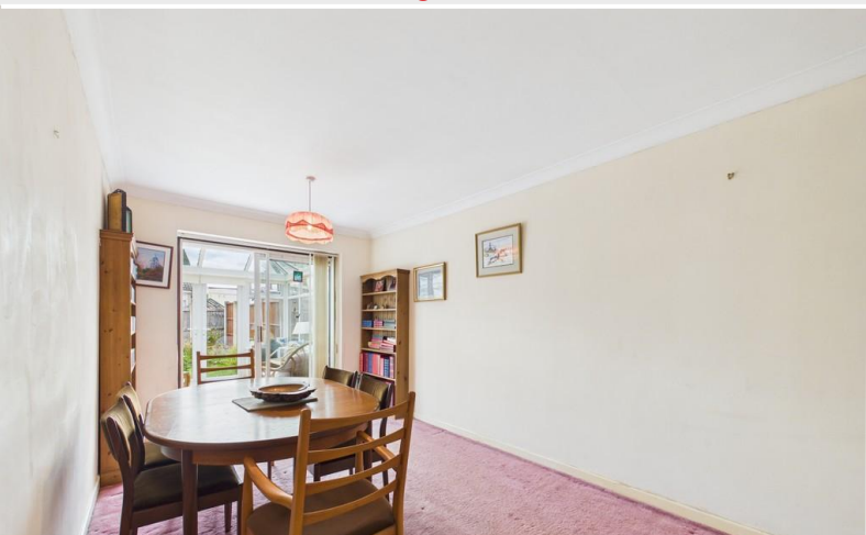
Dining Room/Bedroom Three