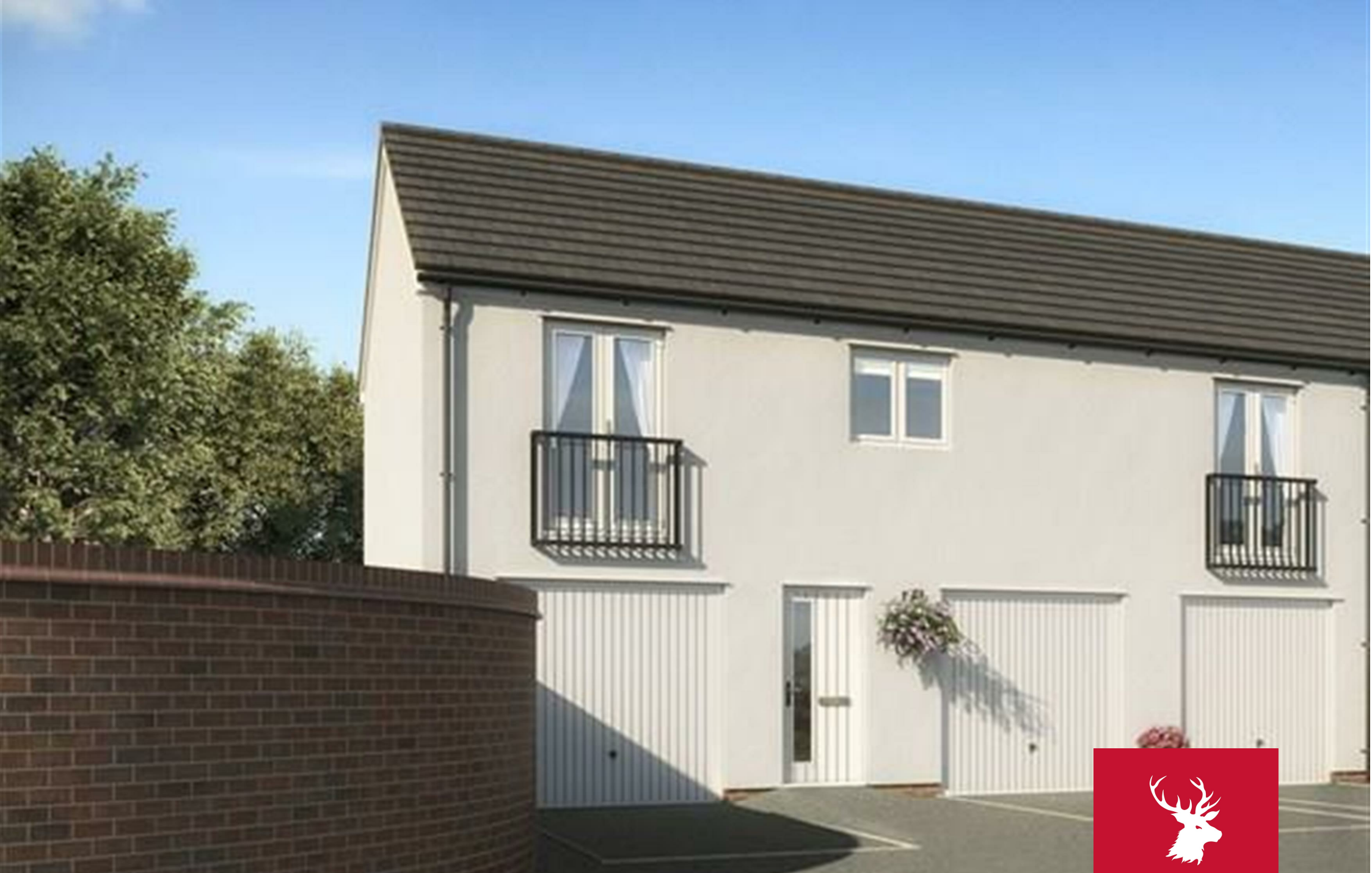
The Redhill, plot 161