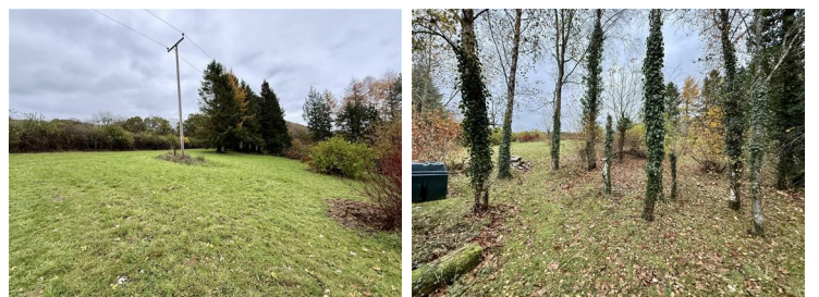
The property is set in mature private gardens and grounds with no near neighbors, being approached by a gated entrance