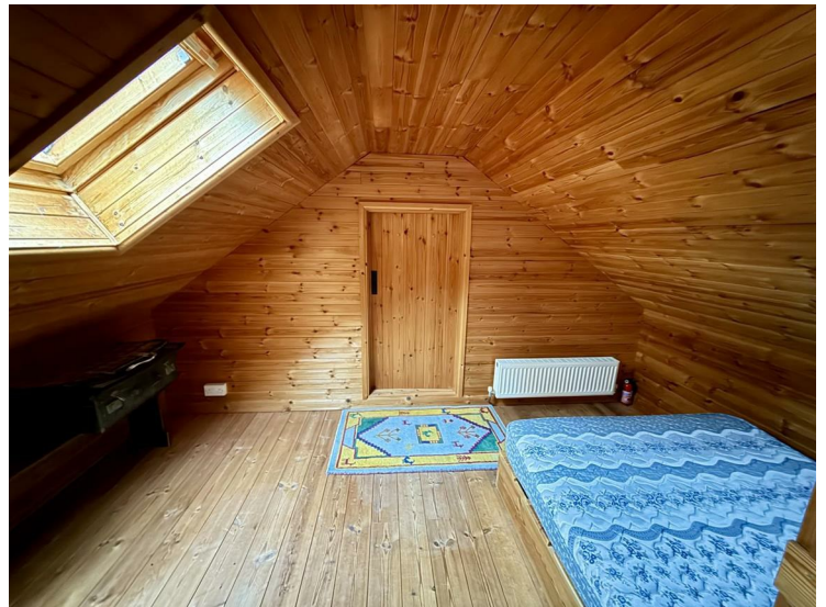
Accessed via a “hit and miss” staircase leading to small landing with access to under eaves storage, Loft Room with tongue and groove ceiling and walls, Velux roof window, Radiator door to: