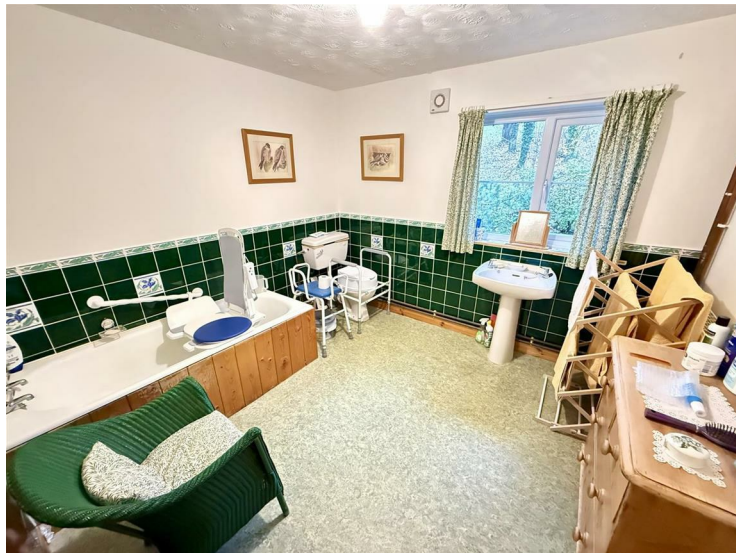
Being half tiled with bath, wash hand basin, toilet, radiator, extractor fan