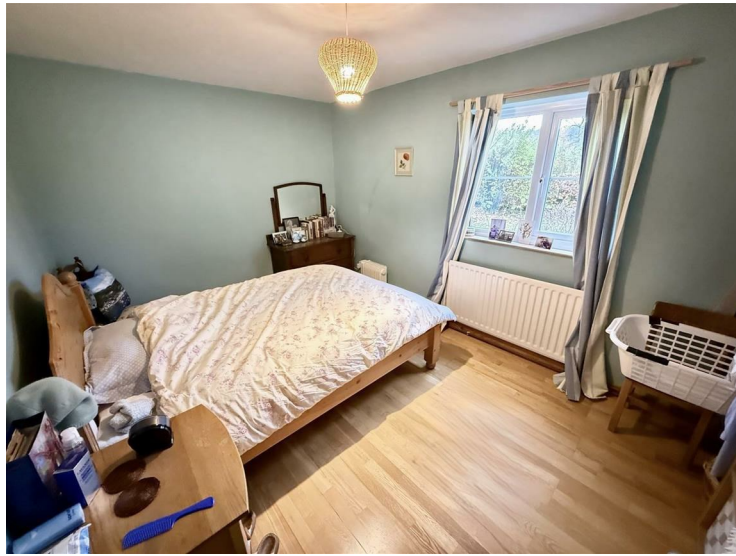
Front window, radiator