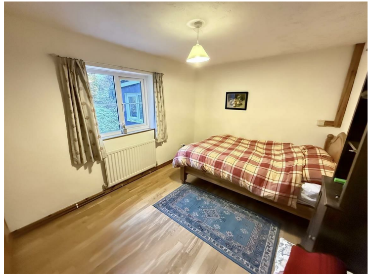
Rear window, radiator