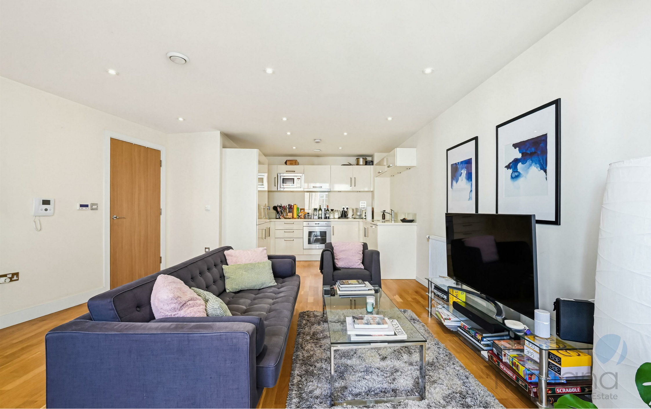
Flat 54 Arc House, 82 Tanner Street London, SE1 3GN £3,000 Per Month