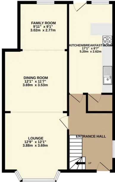
GROUND FLOOR 638 sq.ft. (59.3 sq.m.) approx.