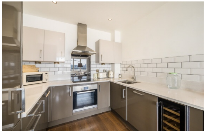
Lock Side Way, E16