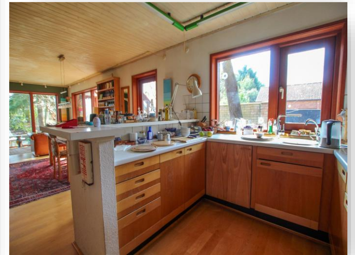
Church End, Rampton, Cambridge, CB24 8QA