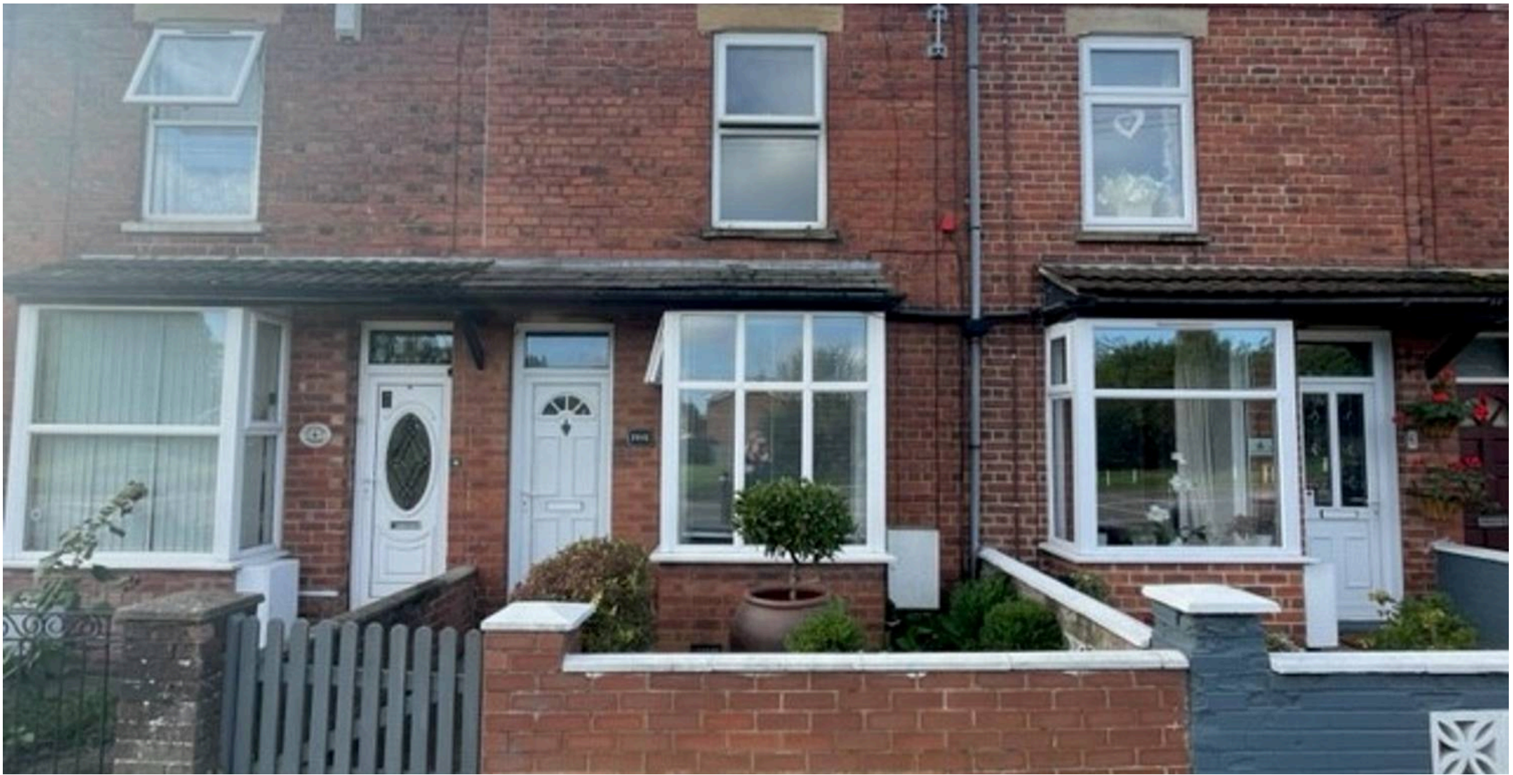
5 Ladysmith Terrace, Gonerby Hill Foot Grantham