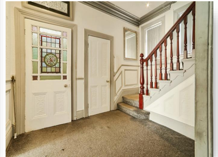
Pearson Lane, Bradford BD9 6BL