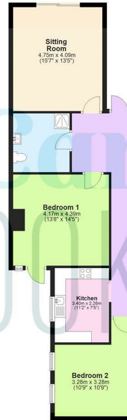
Ground Floor Approx. 79.9 sq. metres (860.0 sq. feet)

Total area: approx. 79.9 sq. metres (860.0 sq. feet)