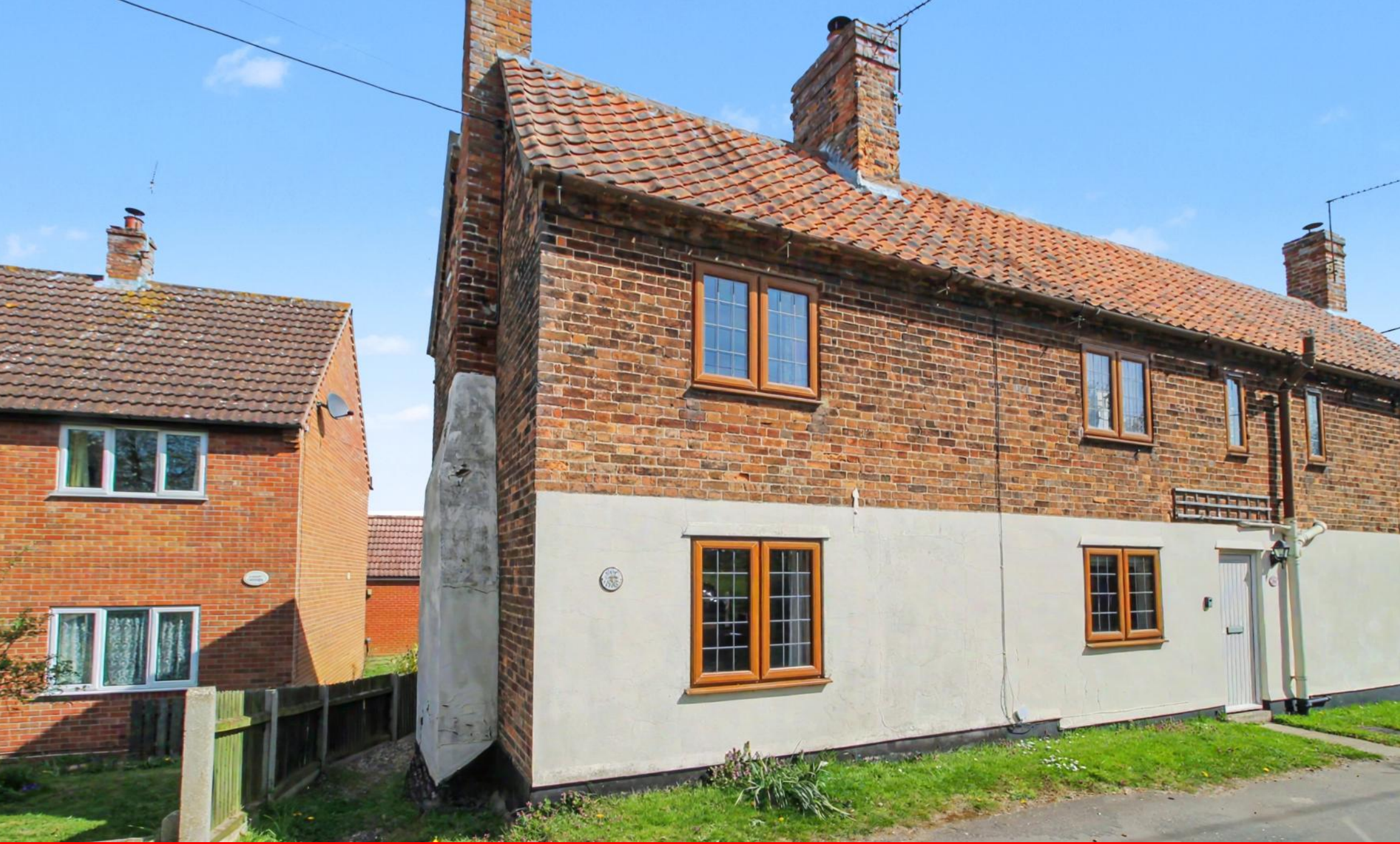
West Cottage, Little London